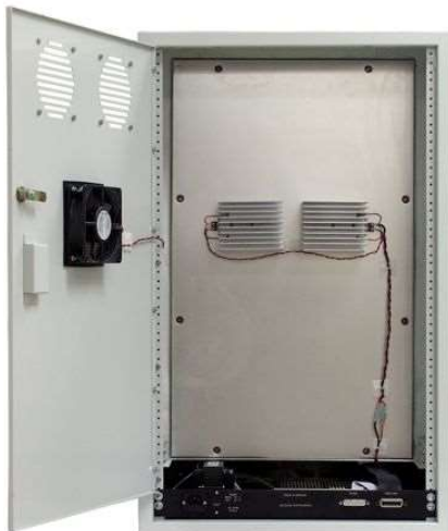
5030 Series Rear Access

These Air Baths have also been designed for ease of field maintenance through the use of modular components and sub-assemblies.