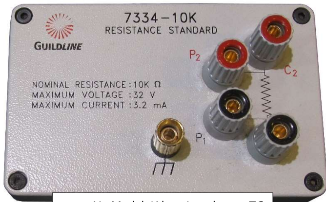
7334 Air Model (Above) and 7334-TC (Temperature Compensated) (Below)

Very High Stability Calibration Laboratory AC/DC Resistance Standards