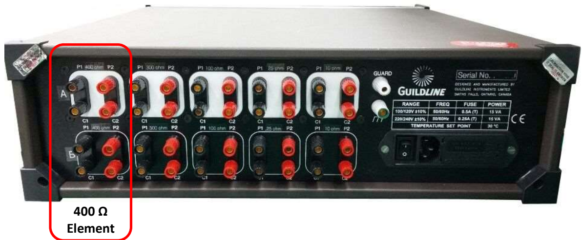
Model 7334-TC with 10 Custom Elements in a Temperature Controlled (TC) Enclosure

Note that these sets shown, when calibrated by an independent National Measurement Institute (NMI) , were reported as "Element Value" White and "Element Value" Black. The results are very impressive as per the following Calibration Report.