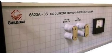
6623A-3S Front and Rear Views

The direct current transformer is designed with an open window to pass through a cable, set of cables, or buss bar that carry the current to be measured. The 6624CT-3000 DC Current Transformer produces an output current that varies directly with the input current in three ranges. By the connection of a reference shunt burden on one of the output terminals the current can also be calculated by measuring the voltage drop across the reference shunt. All necessary interconnections for the control of the 6623A-3S Current Transformer Controller unit and the 6624CT-3000 Current Transformer are provided such that no hardware reconfiguration is required over the full range of operation other than the connection of the output current terminal to an appropriate reference burden.