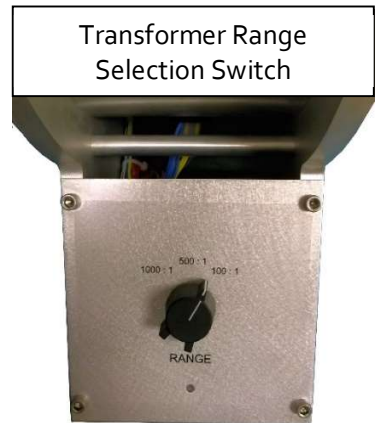
Transformer Range Selection Switch

NOTE that custom DC CTs can be provided up to 10,000 Amperes.